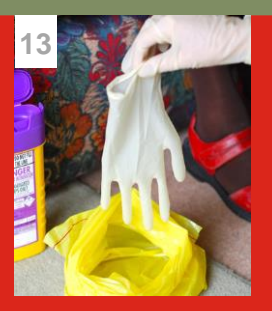
Dispose of Gloves then apron & immediately...