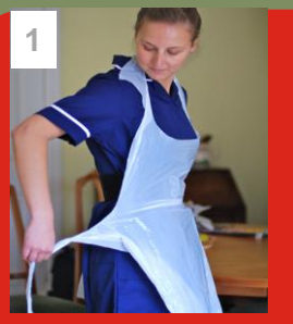
Apply Disposable Apron