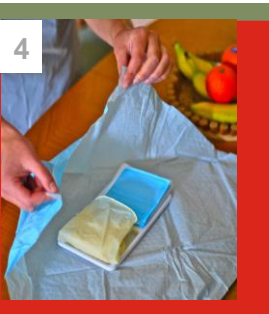
Open Pack Manage as a General Aseptic Field using nontouch technique (NTT)