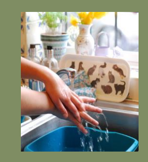
When leaving the patient's home disinfect hands