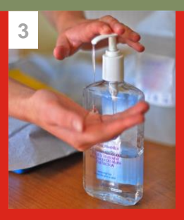
Disinfect Hands with alcohol hand rub or soap & water