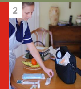
Gather Equipment & place around the pack