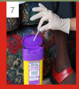
Dispose of Sharps and equipment