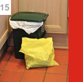
Dispose of Waste according to local policy