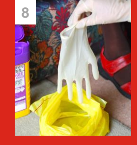
Dispose of Gloves