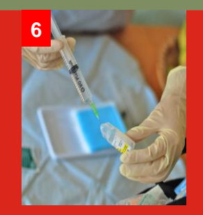
Apply Non-Sterile Gloves according to local policy