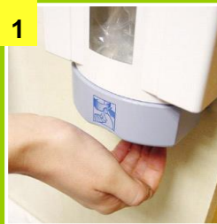
1 Clean Hands with alcohol hand rub or soap & water