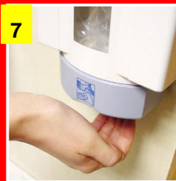
7 Clean Hands with alcohol hand rub or soap & water