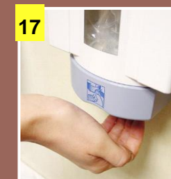
17 Clean Hands with alcohol hand rub or soap & water