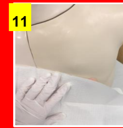
11 Apply sterilized drape under Implantable port site