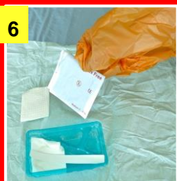
6 Open Equipment onto a Critical Aseptic Field & prepare using the inside of the waste bag