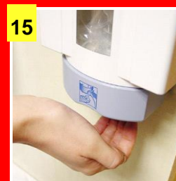
15 Clean Hands with alcohol hand rub or soap & water