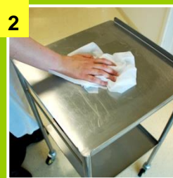
2 Clean Work Surface (e.g. dressing trolley) as per local policy