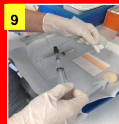
9 Prepare Critical Aseptic Field using NTT to protect key-parts where practical