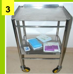
3 Collect Equipment and supplies