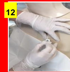
12 Insert Gripper needle using NTT