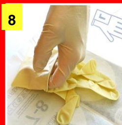
8 Apply Sterilized Gloves