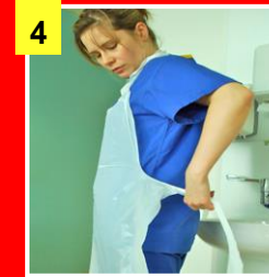
4 Apply Apron (Disposable)