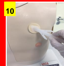
10 Disinfect skin using 2% chlorhexidine / 70% alcohol applicator for 30 secs using a cross hatch method & allow to dry