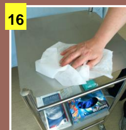
16 Clean Trolley according to local policy.