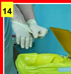
14 Dispose of Waste, remove gloves & apron, and immediately ...